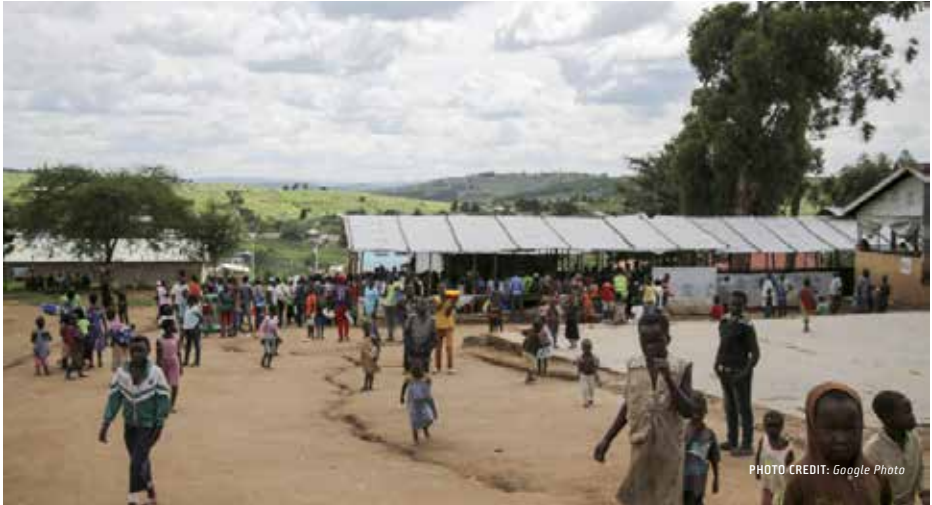
Kyegegwa's Kyaka II refugee settlement