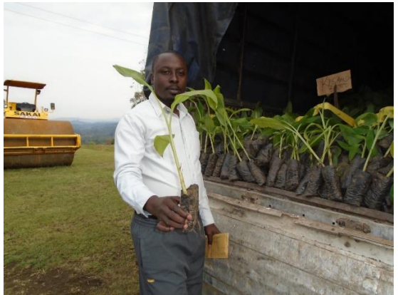
The District Commercial Officer displaying a tissue cultured banana plantlet from the delivered consignment

3. Quality assurance of agricultural inputs and food supplies i.e. verified and distributed 10 tons of Maize seed (FH6150 Variety), 11,500 tissue cultured banana plantlets; 719,110 coffee seedlings and 80 tons of relief rice under OWC; 1,400 sachets of tomato seed of 25 g each (variety Money maker); 1,400 sachets of onion seed of 25 g each (variety Red Creole); 1.400 sachets of eggplant seed of 25 g each (variety Black beauty and African eggplant) and; 300 sachets of cabbage seed of 25 g each (variety Copenhagen) under Oxfam; 100 bags of Napier grass seed, 10 tons of maize (variety Bazooka) and 10 tons of beans (NABE 4) under FAO/BRAC; 1,000 sachets of tomato seed of 25 g each (variety Tengeru); 1,000 sachets of cabbage seed of 25 g each (variety Fanaka); cauliflower, spinach and Okra under the Red Cross and; 500 mango seedlings (varieties: Zillate and Tommy); 500 orange seedlings (variety Hamlins) and 2 motorized knapsack sprayers for persons with special needs in Nyakatoma and Bukere under Save the children. Under ACDP, 810 bags of fertilizers of 50Kg each (NPK), bean seed (1,600 Kg of variety NABE 17), maize seed (2,400 Kg of variety Bazooka), farm tools (41 pangas, 45 secateurs and 47 pruning saws), 36 liters of herbicide, 520 tarpaulins and 639 hermetic bags were inspected and given out to farmers.