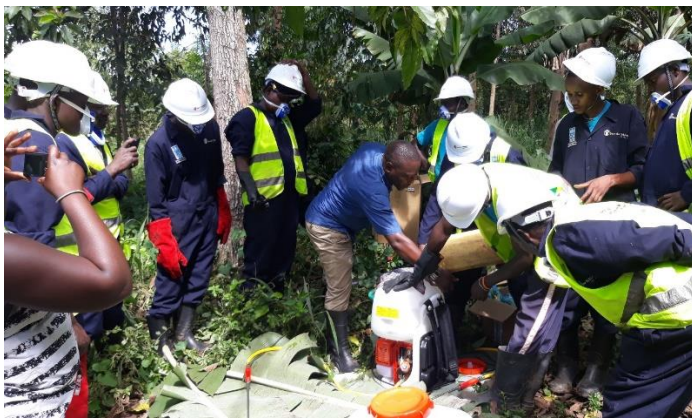
Assembly and testing a high pressure motorized knapsack sprayer procured by Save the Children for persons with special needs in Bukere, Kyegegwa S

4. 532 farm visits and technical supervisory visits were carried out in all 9 LLGs