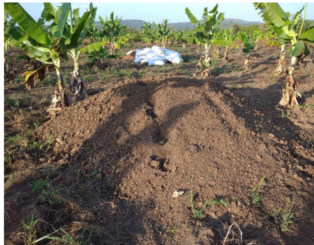
Cow dung (in the foreground) and sacs of coffee husks (in the background) procured and delivered to Karugaba Deogratious of Kidindimya LCI, Kibuuba parish, Kasule S/C