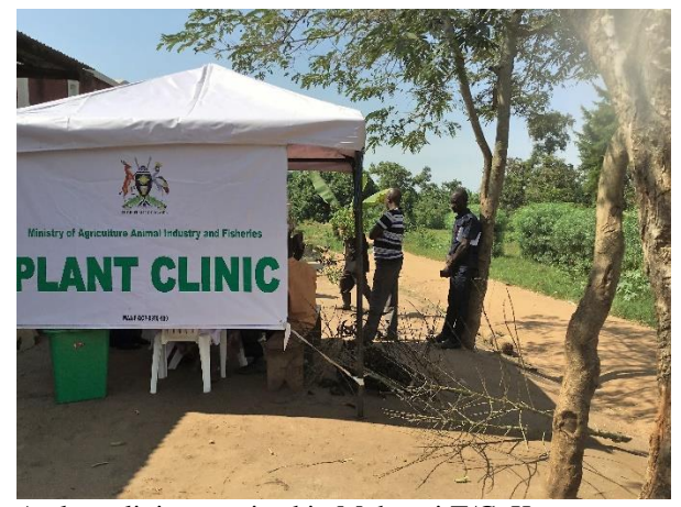
A plant clinic organized in Muhangi T/C, Kyegegwa S/C in July 2019

2. 6 mobile plant clinics were operated in Kyamagabu (Mpara S/C), Muhangi (Kyegegwa S/C), Kidindimya (Kasule S/C), Katarubata (Ruyonza S/C); Kayembe (Rwentuha S/C and Kyatega (Kakabara S/C)