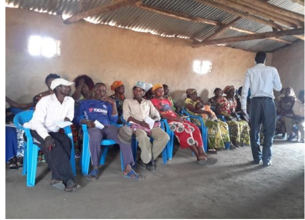
Mr. Tumuhereze Devunary training farmers in Kyaka II refugee settlement on vegetable production under Red Cross