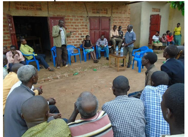
Members of Kigorani Veterans Association listening to the UCDA officer in a brief training organized on coffee pest control