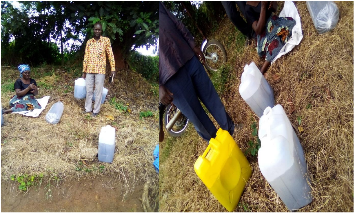
Some of the Farmers who received /receiving fish fingerlings at district production office