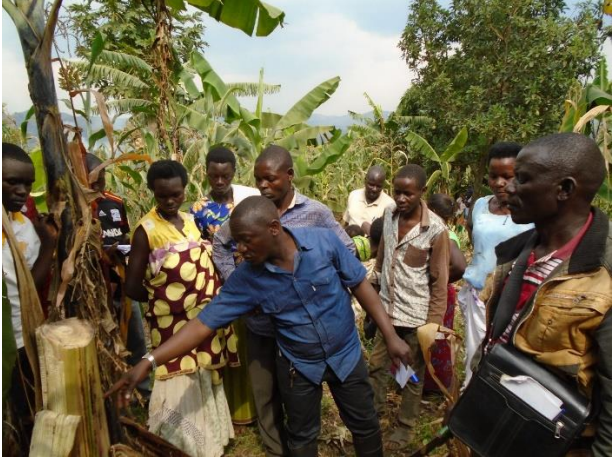
Demonstration of BBW prevention and control at Nyabuliko LCI, Kigambo S/C

2. 6 mobile plant clinics were operated in Kyamagabu (Mpara S/C), Muhangi (Kyegegwa S/C), Kidindimya (Kasule S/C), Katarubata (Ruyonza S/C); Kayembe (Rwentuha S/C and Kyatega (Kakabara S/C)