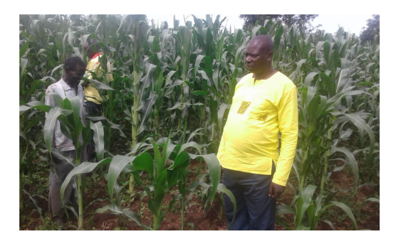
District Chairperson monitoring ACDP supported maize garden in Ruyonza Sub County